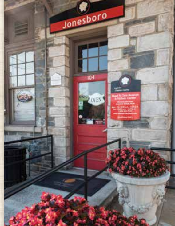
Downtown Jonesboro Retail

Clayton State University also works with local school systems to implement the dual enrollment Move On When Ready program, offering qualified high school students the option to begin working toward their college degrees while still pursuing their high school diplomas. This program enables participants to fulfill high school graduation requirements by taking college courses that provide dual credit, so they simultaneously complete high school course requirements.